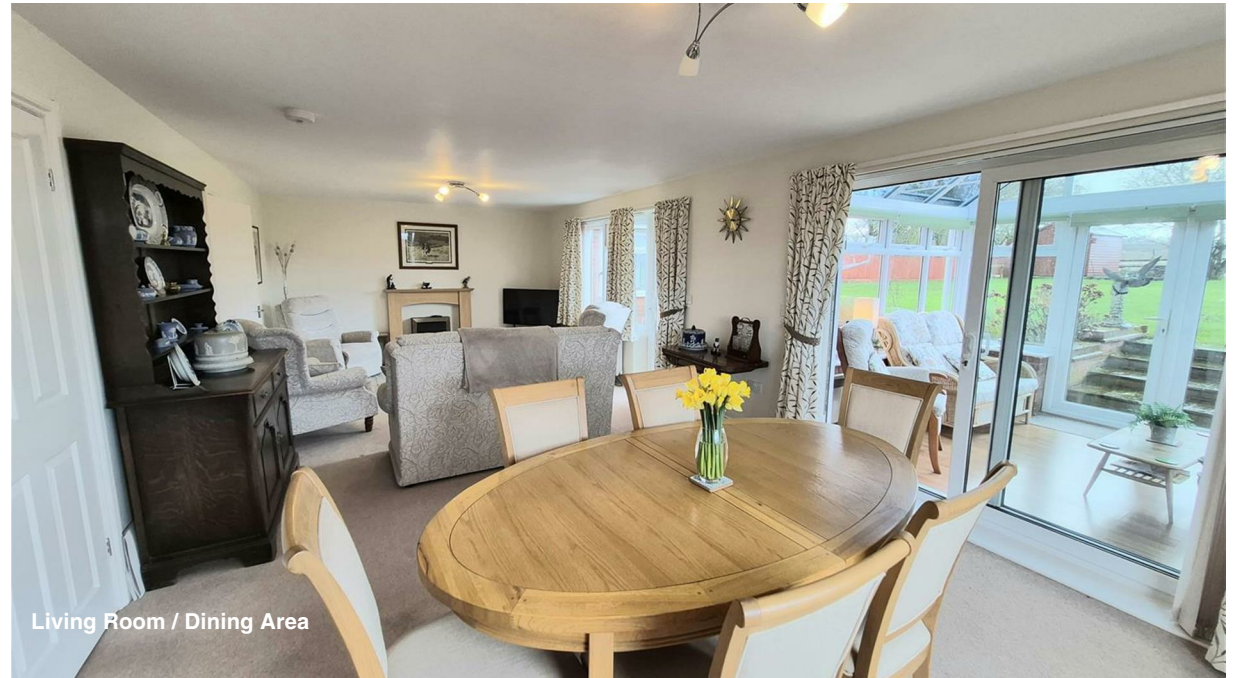
Living Room / Dining Area

Perfectly positioned to enjoy the tranquillity of the Vale of Belvoir, this standout home on Hickling Lane captures the very best of village life in Long Clawson. It's a property that balances high-specification modern finishes with a genuine sense of space, offering an open-plan layout that transitions seamlessly to a generous garden. Whether you're drawn to the stunning open views or the convenience of having an award-winning deli and local school just a short stroll away, this instruction represents a rare opportunity to move straight into a beautifully finished home in a premier Leicestershire location.